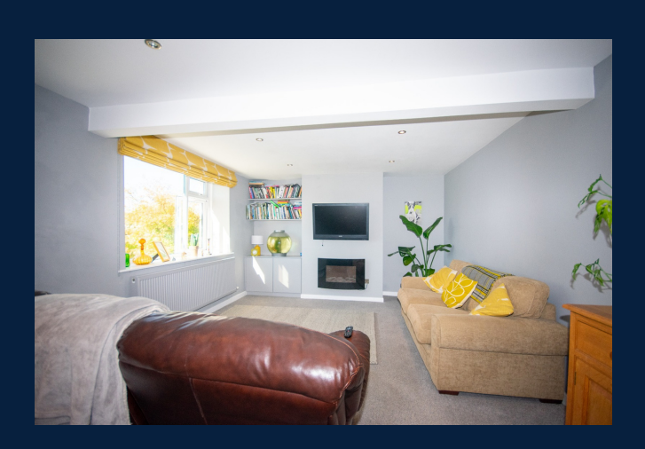
Lounge A cosy lounge with a feature fireplace at its focal point. A large window looks out over the private garden and terrace.