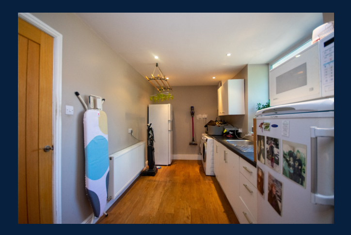
Utility A helpful plumbed utility found just off the entrance hall, with easy access from the front elevation and kitchen.