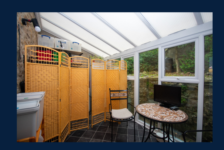
Conservatory A gorgeous sunny room looking out into the rear garden, with access from the kitchen and into the garden.

large three pane window allows plenty of light and provides views into the garden.