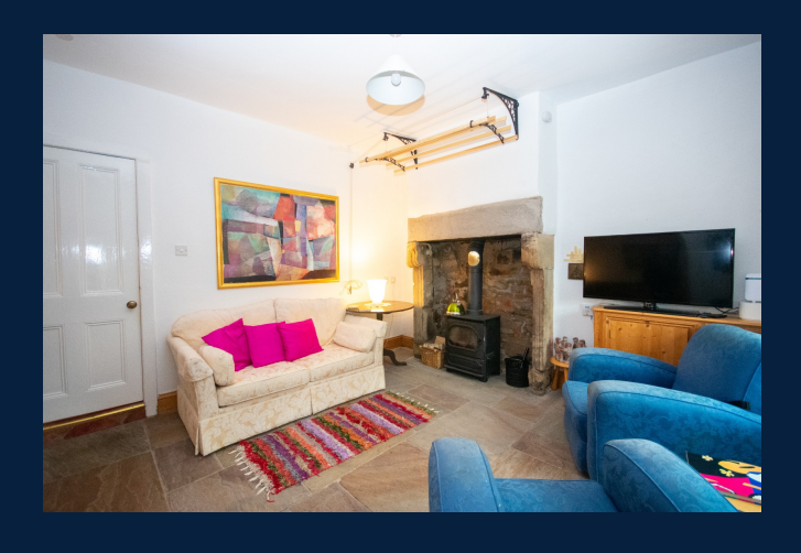
Lounge A spacious lounge with a feature fireplace at its focal point, and a large top opening window which fills the room with natural sunlight throughout the day.