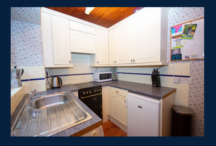
Kitchen A lovely kitchen space providing the perfect opportunity for modernisation. A

large three pane window allows plenty of light and provides views into the garden.