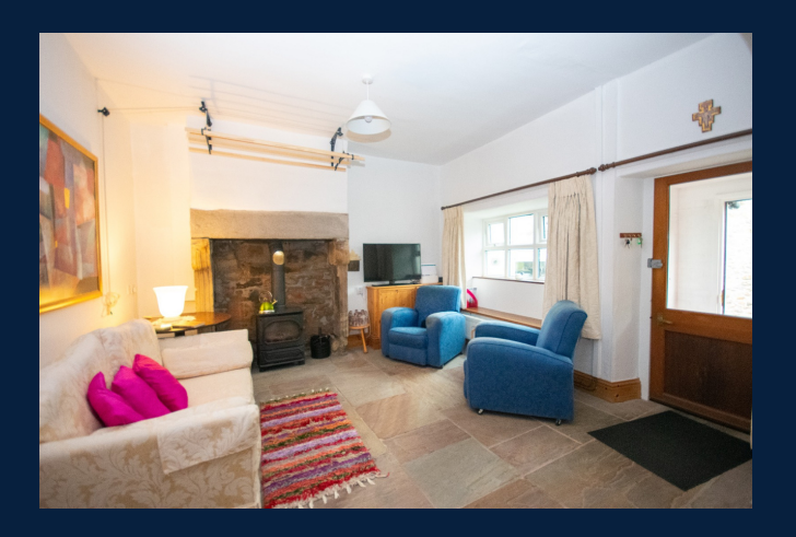
Porch A welcoming entrance porch providing direct access to the lounge.